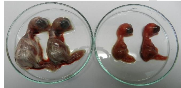
Fig. 2: In-ovo propagation of IBV; Left side has control group and Right side has IBV infected group.