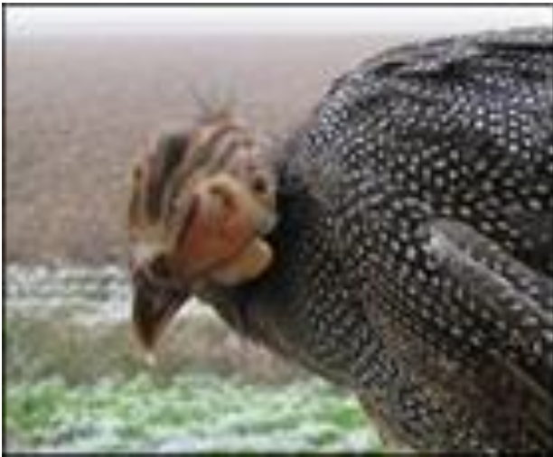
Fig. 1: Swollening of periocular tissues in a guinea fowl from the flock affected by aMPV infection.

Sneezing, nasal exudates, conjunctivitis and ocular discharge were observed from 70 days of age. Some birds showed oedematous periocular swelling (Fig. 1). Feed intake was reduced. Birds were treated with Colistin for 4 days. Mortality did not exceed 1%. Birds were only vaccinated for Newcastle disease (B1 strain), by spray at day-old and 22 days of age.