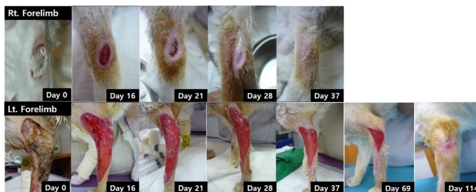
Fig. 1: Extensive skin necrosis by cutaneous adverse drug reaction in a cat. On day 0, right and left forelimbs showed well demarcated area of dead skin, necrotic changes and erythema around skin lesions. Over time, the entire area was slough and beginning to form granulation tissue. The necrotic lesions disappeared with the skin restoration (right forelimb, day 37; left forelimb, day 114).