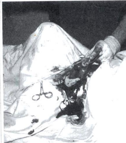
Plate 2: Showing completion of Appositional two layer pattern performed for anastomosis of colon in dog.