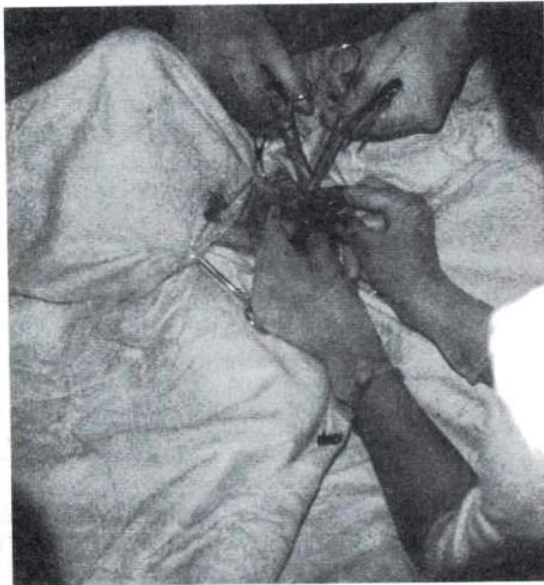
Plate 1: Showing closure of the first layer of Appositional two layer pattern for anastomosis of colon in dog.

^= significant different from control at (P<0.05).