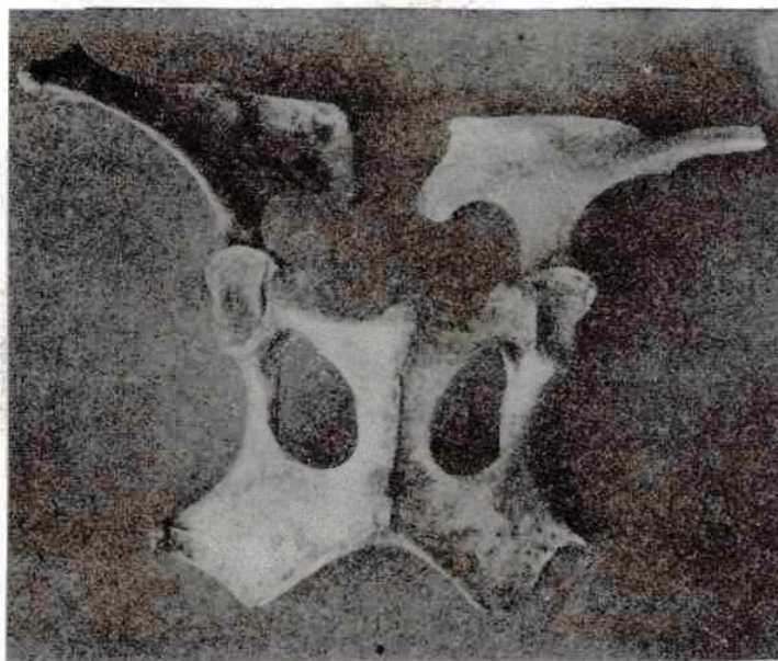
Plate 2: Ossa coxarum of buffalo (ventral view).