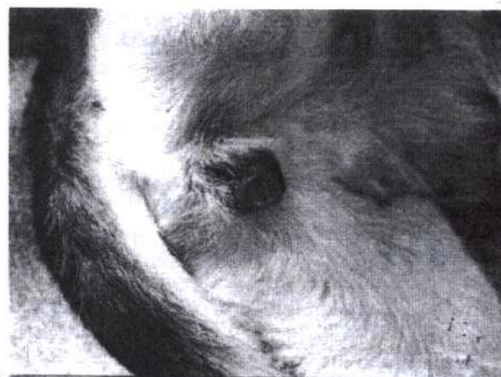
Plate 1: Transmissible venereal tumour in a female dog. A cauliflower-like granulated mass protruding out of the vulva.

infiltration mainly of lymphocytes were also seen (Plate 4).