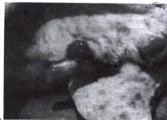
Plate 2: Transmissible venereal tumour in male dog. Note the involvement of shaft of penis and prepuce.