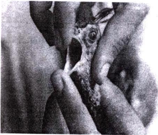
Plate 1: Glossoptosis (downward displacement of tongue) due to a kite-flying thread in a peafowl

The thread was then cut as high as possible through the crop. As soon as it was cut, the tongue relaxed and gradually restored back to its anatomical location in the oral cavity. The birds started respiring normally and became significantly relieved. The crop wound was then closed by simple interrupted approximating suture pattern using 3/0 chromic catgut followed by a similar suturing of the skin using a similar gauge surgical silk. Proximal part of the thread was then searched through the opened beak of the birds and removed by unwinding the thread from around the base of tongue. In two of the birds, it was found that a further delay in this relieving operation would easily lead to the sawing through the base of the tongue by these culprit threads and hence leading to the death of the birds.