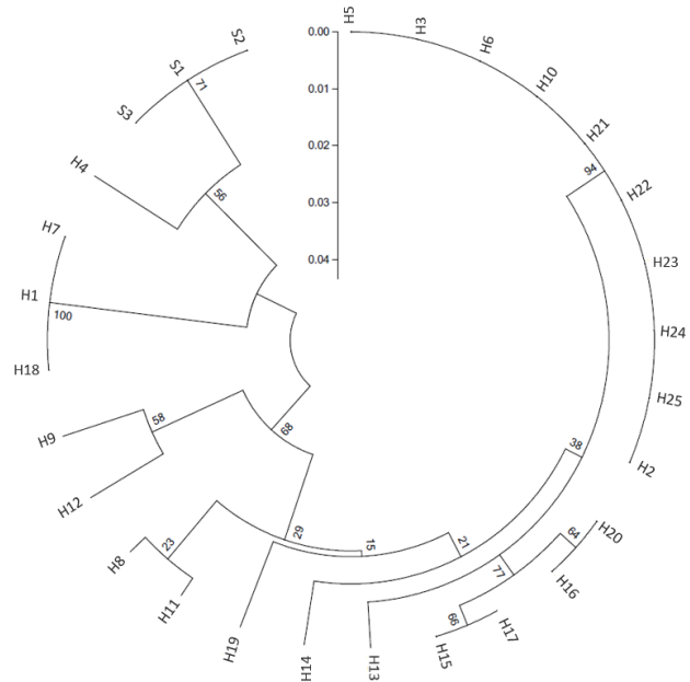
Fig. 2: Circular Neighbor-Joining Tree (NJ) (MEGA v6.1) that defines the genetic distance between seropositive and healthy individuals for Bovine Major Histocompatibility System (BoLA) DRB3 exon 2 gene region following sequence analysis. H: seropositive individuals, S: Healthy individuals