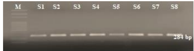
Fig. 1: Agarose gel image of BoLA-DRB3.2 gene amplicons after PCR purification of 8 samples from BLV seropositive cattle (M: Marker, S1-S8: Samples)

Using the F_{ST} of the individuals evaluated in the study and the tree in which the populations were evaluated as a total, it was observed that healthy individuals were genetically distant from seropositive individuals (Fig. 2) (Nei and Kumar, 2000; Excoffier and Lischer, 2010).