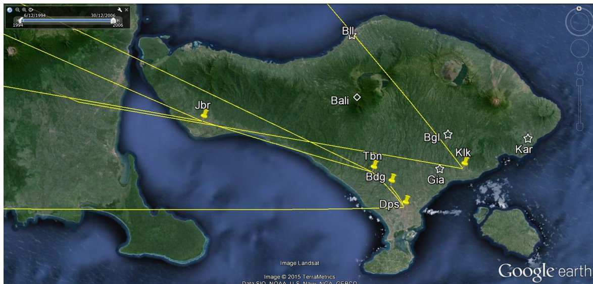
Fig. 3: Close up of Fig. 2 showing HPAIV-H5N1 dispersal to, in, and from Bali. Abbreviations for districts in Bali are as in Fig. 1.