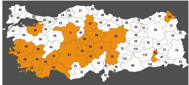
Fig. 2: The number of examined sheep and the provinces with tick infestation (colored with orange).