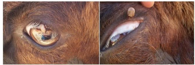
Fig. 1: Ticks on upper eyelid of sheep.

Ethical statement: The approval of the owners of sheep was obtained before sampling. All procedures used were applied according to the ethical guidelines for the use of animal samples permitted by Selcuk University, Faculty of Veterinary Medicine (Permit for animal experiment: 2017/36, Date: 27.03.2017).